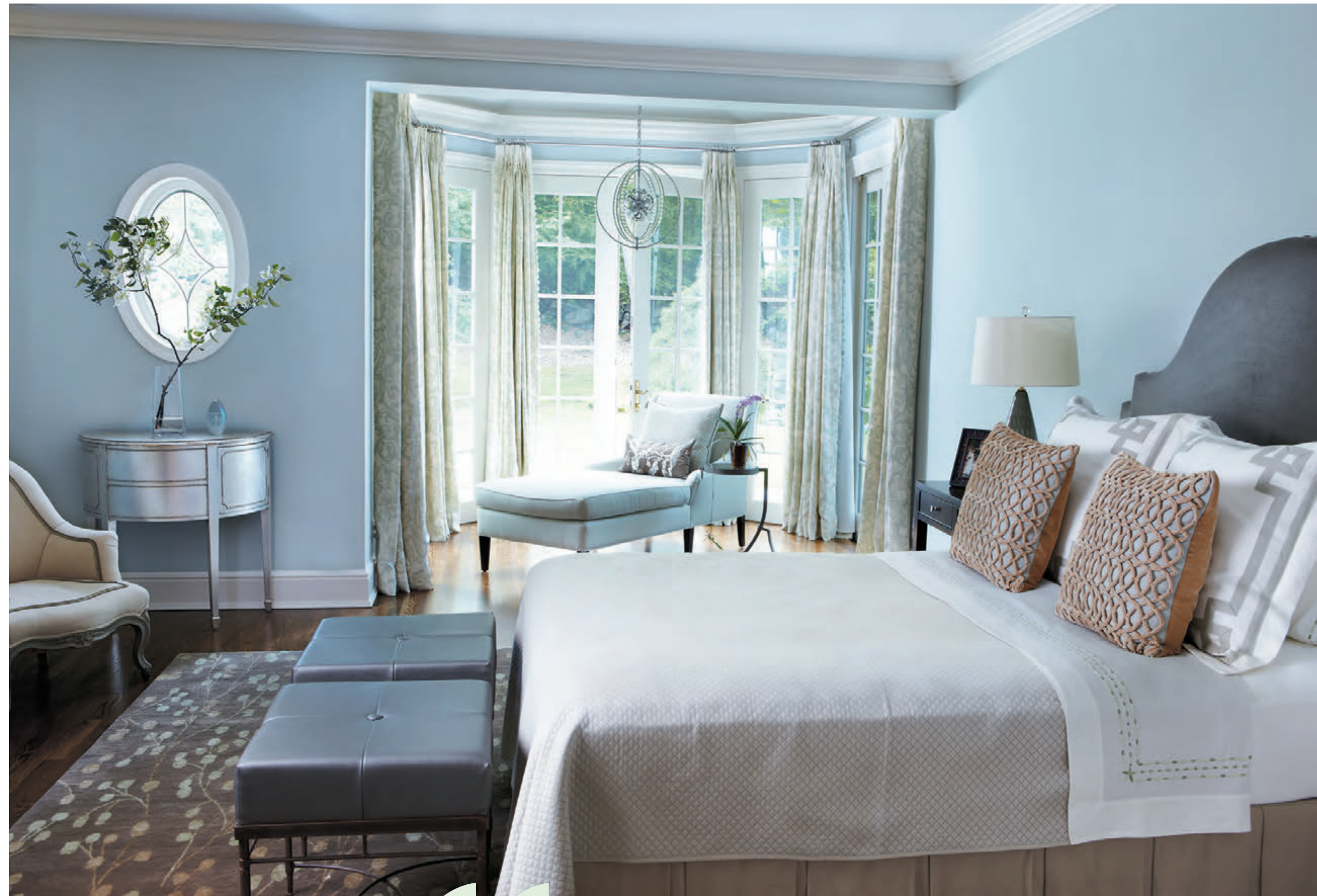
Inner Sanctum (ABOVE) In the master bedroom, Quadrille linen drapes sport a Samuel & Sons trim. A Canopy Designs light fixture adds shine to the alcove. Bed linens are through Lynness. Headboard fabric is through Rogers & Goffigon. See Resources.