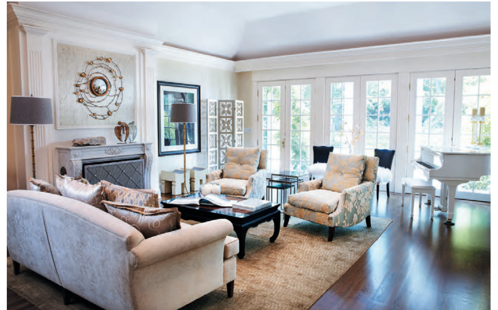
Sitting Pretty (CLOCKWISE FROM ABOVE) Club chairs in an Osborne & Little cut velvet and a sofa in Osborne & Little chenille through Tiger Lily's provide seating around a Yumi cocktail table from Kindel Furniture. Nesting side tables are through Donghia. Sofa pillow fabric is through Kravet. Center 44 floor lamps are topped with shades from Just Shades. Capellini had decorative bronze charms sewn onto the library drapes. In the living-room, an elegant settee covered in Chapka faux lamb fabric through Stark Fabric and Nobilis vinyl beckons under vintage silver-leaf framed botanical prints from George Glazer Gallery. White Hwang Bishop side table is through Schumacher. In Michael Fazio's office, a traditional tweedy chair is paired with a whimsical ottoman covered in cowhide. Wingback chair is through Mis en Scene. Schumacher ottoman is covered in Edelman leather. Fuse Lighting floor lamp is through Dennis Miller Associates. See Resources.