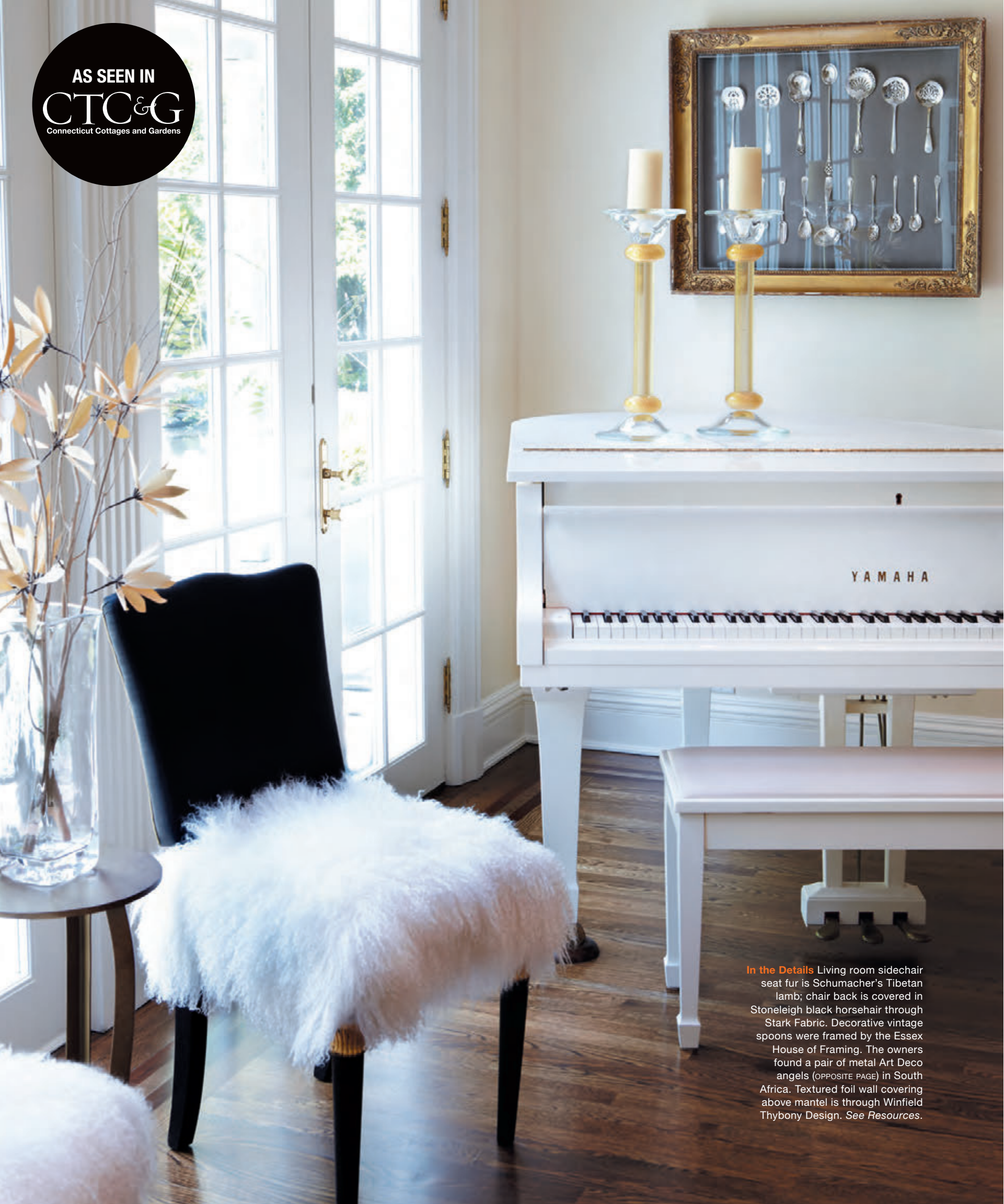
In the Details Living room sidechair seat fur is Schumacher's Tibetan lamb; chair back is covered in Stoneleigh black horsehair through Stark Fabric. Decorative vintage spoons were framed by the Essex House of Framing. The owners found a pair of metal Art Deco angels (OPPOSITE PAGE) in South Africa. Textured foil wall covering above mantel is through Winfield Thybony Design. See Resources.