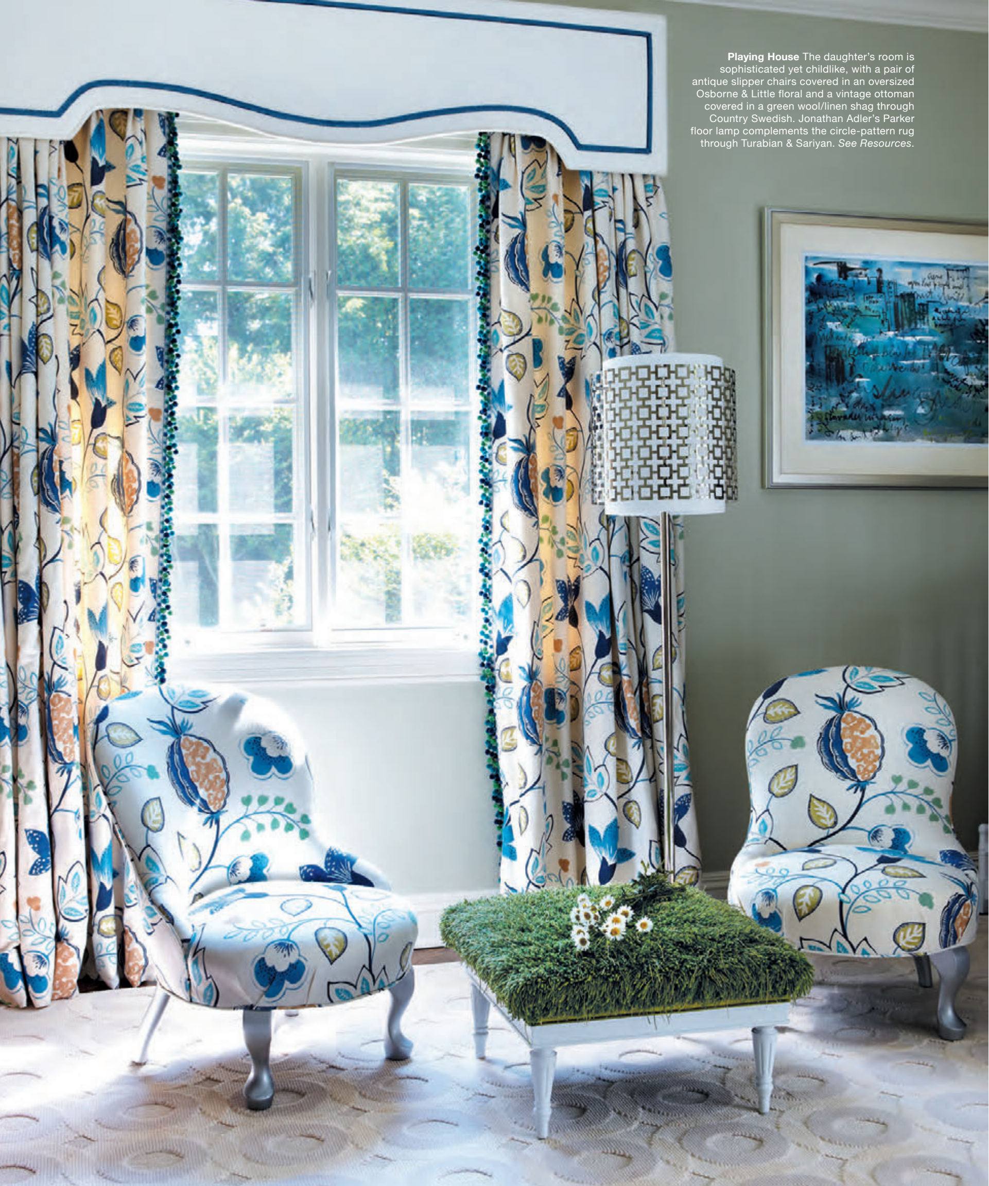
Playing House The daughter's room is sophisticated yet childlike, with a pair of antique slipper chairs covered in an oversized Osborne & Little floral and a vintage ottoman covered in a green wool/linen shag through Country Swedish. Jonathan Adler's Parker floor lamp complements the circle-pattern rug through Turabian & Sariyan. See Resources.